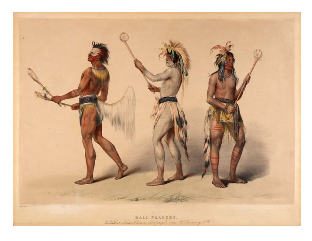
Figure 1. Ball Players. George Catlin. Date unknown.

American Indians are thought to have founded the modern game of lacrosse, as well as other stick games. Lacrosse, which received its name from French settlers, was more than a form of recreation. It was a cultural event used to settle disputes between tribes.